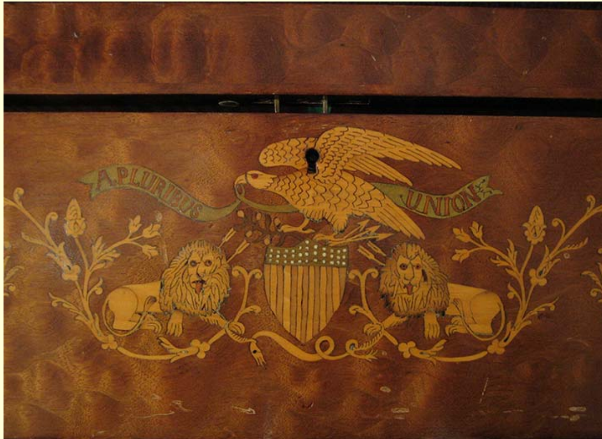
Close-up of Front