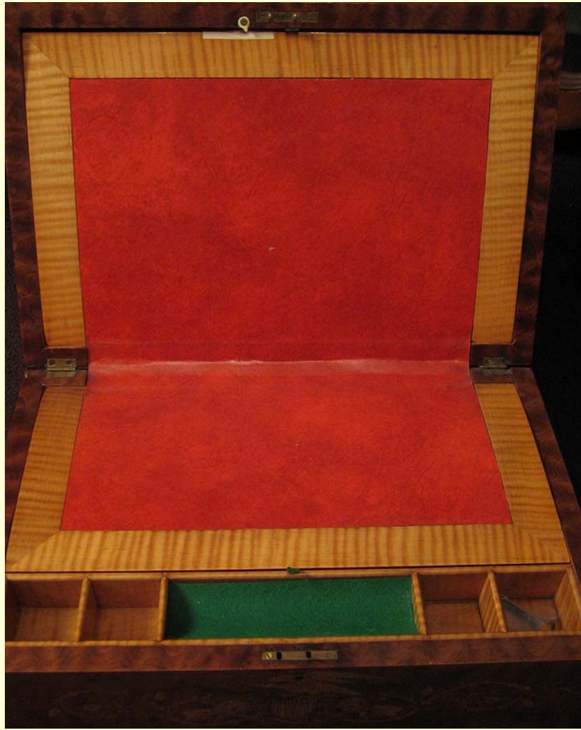
Interior of Lap Desk