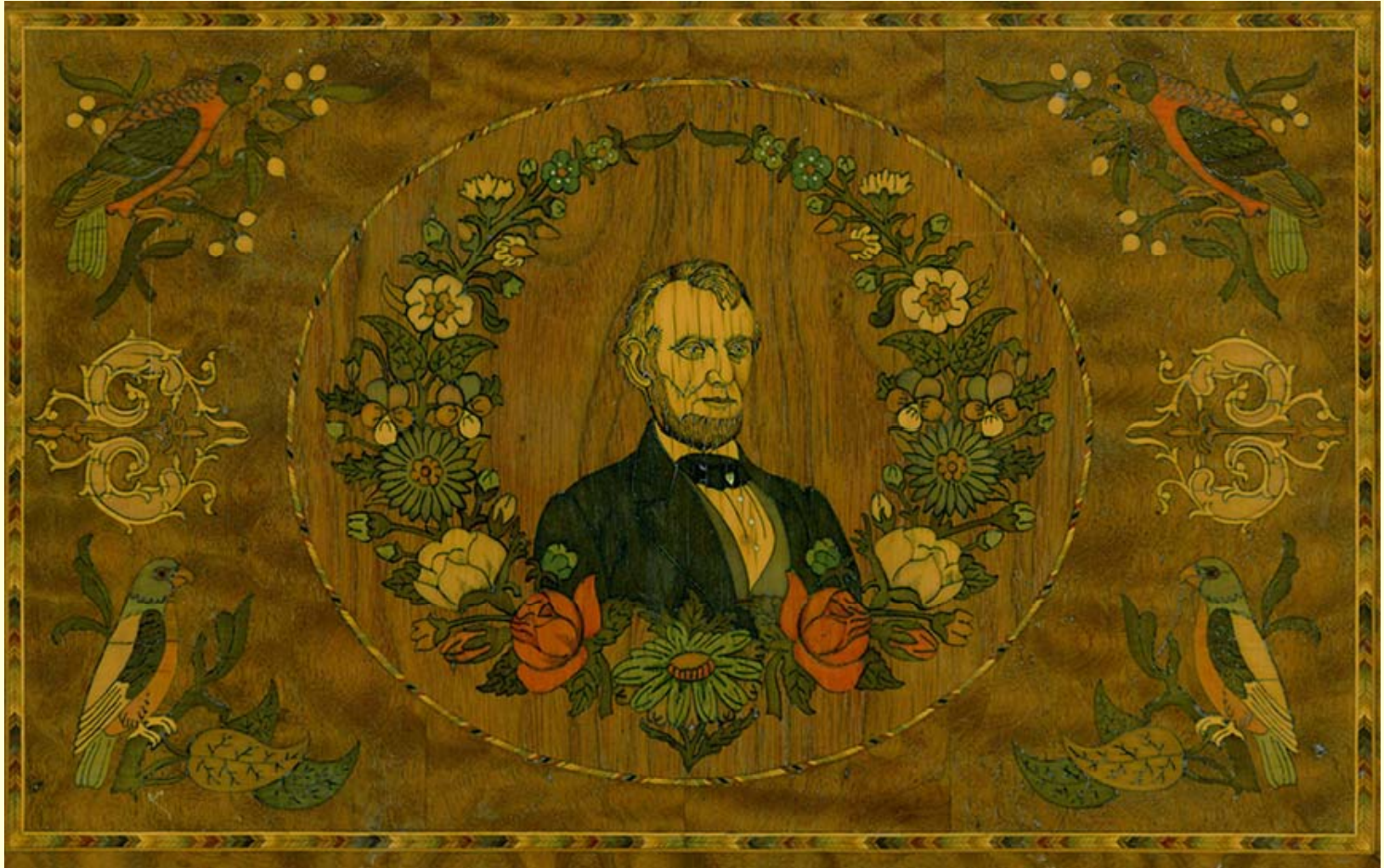
Top of Lap Desk